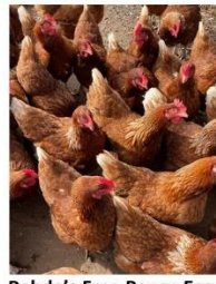
Rohde's Free Range Eggs