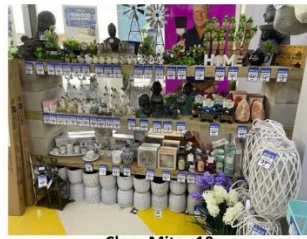
Clare Mitre 10