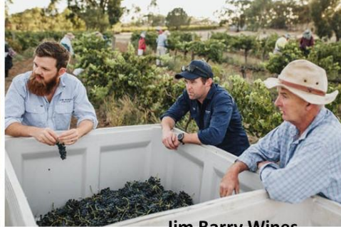
Jim Barry Wines