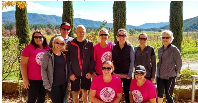
Below: Tour de Vines Cycling Group