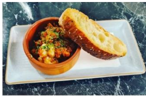
The Little Red Grape Leasingham