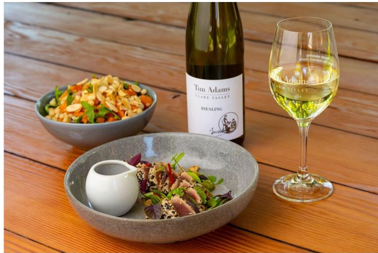
Tim Adams Wines