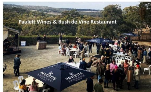
Paulett Wines & Bush de Vine Restaurant