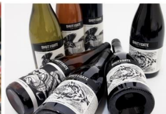
Shut the Gate Wines