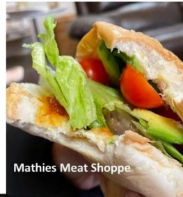
Mathies Meat Shoppe