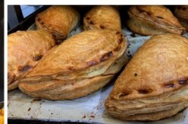
Clare Rise Bakery