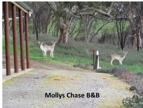
Mollys Chase B&B