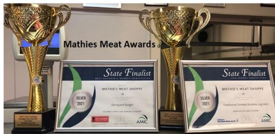
Mathies Meat Awards