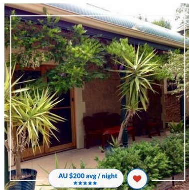
Clarevale Cottage B&B