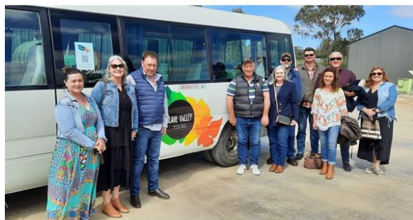
Left: Clare Valley Tours