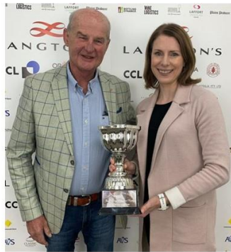
Above: Jim Barry Trophy, Best Wine of Show