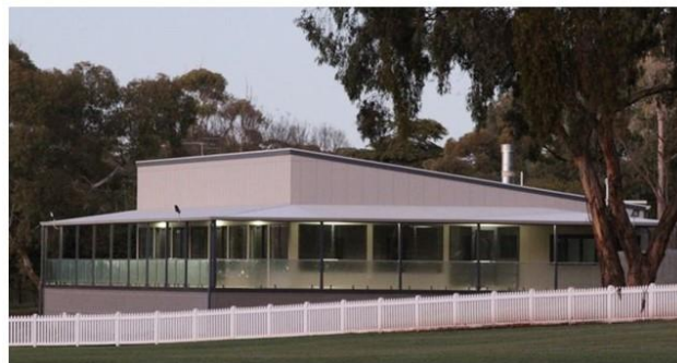
Right: MacKenzie Homes & Commercial Pty Ltd.