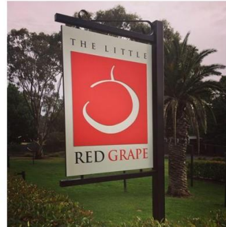
GREAT AUSSIE PIE COMPETITION 2021