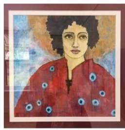
Arts Collective Painting by Lou White