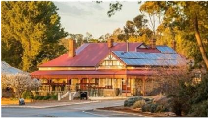
Watervale Hotel 'Best Environmental & Energy Efficient Practices Hotel'