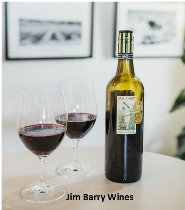
Jim Barry Wines