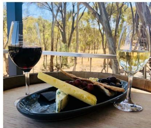
Tim Adams Wines