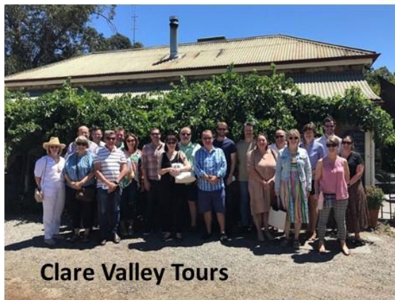
Clare Valley Tours