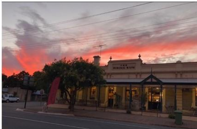
Rising Sun Hotel, Auburn