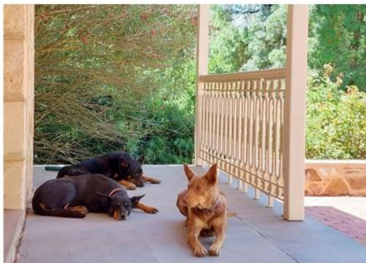
Left: Bungaree Station a few days after sheep work