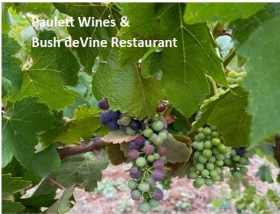
Paulett Wines & Bush deVine Restaurant