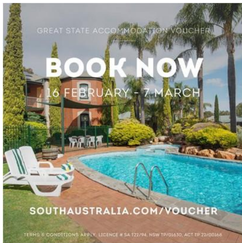
Clare Country Club