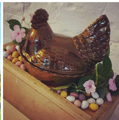
Watervale General Store