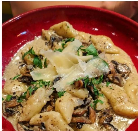
Upside Restaurant & Wine Bar