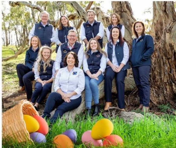
Below: Calaby Real Estate