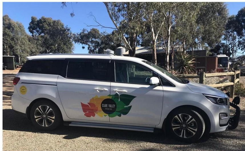
Clare Valley Tours