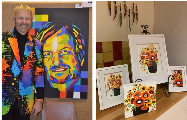
Arts Collective Clare Valley