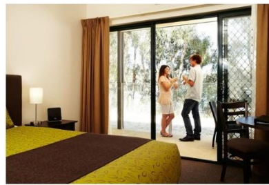
Clare Country Club