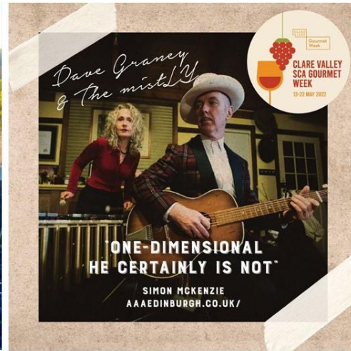
Shut the Gate Wines