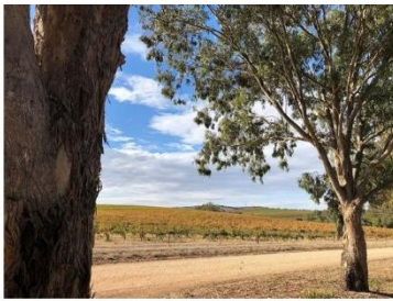
Bed in a Shed Accommodation ... view from the window