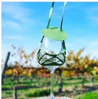
Clare Valley Art Gallery