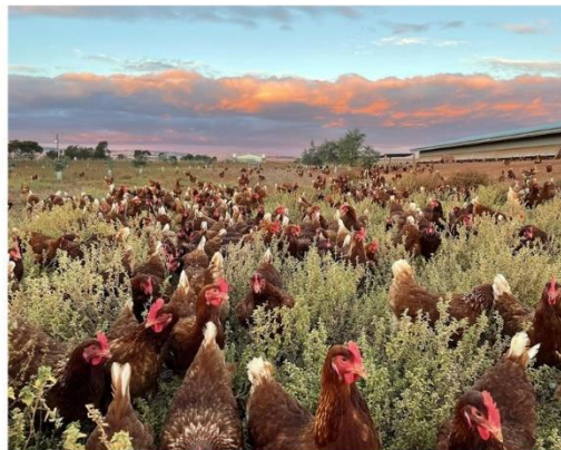
Rohde's Free Range Eggs