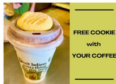
Clare Rise Bakery