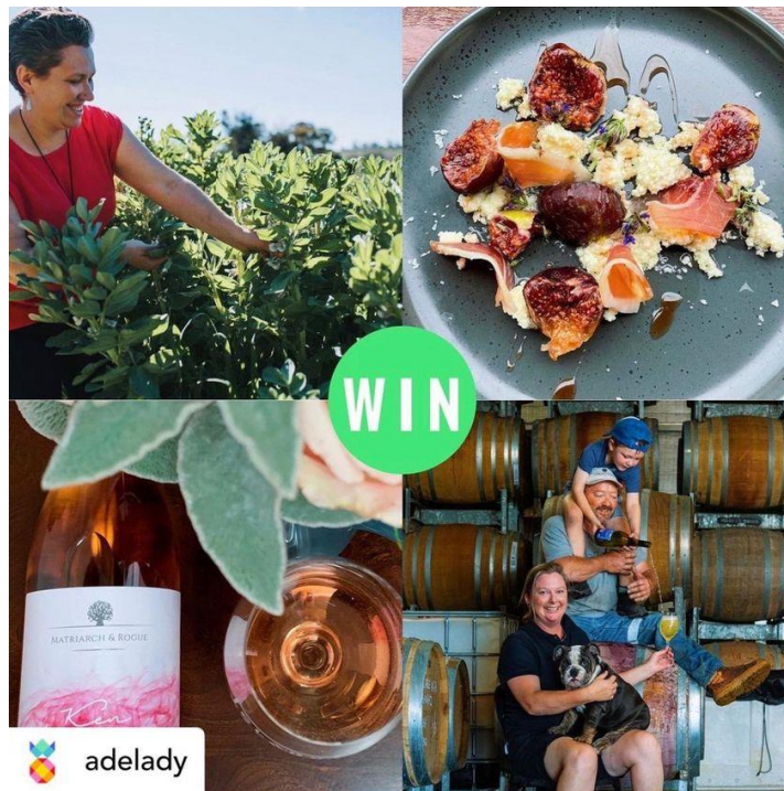
The Watervale Hotel