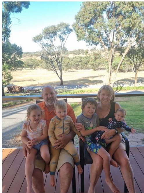
Neagles Retreat Accommodation