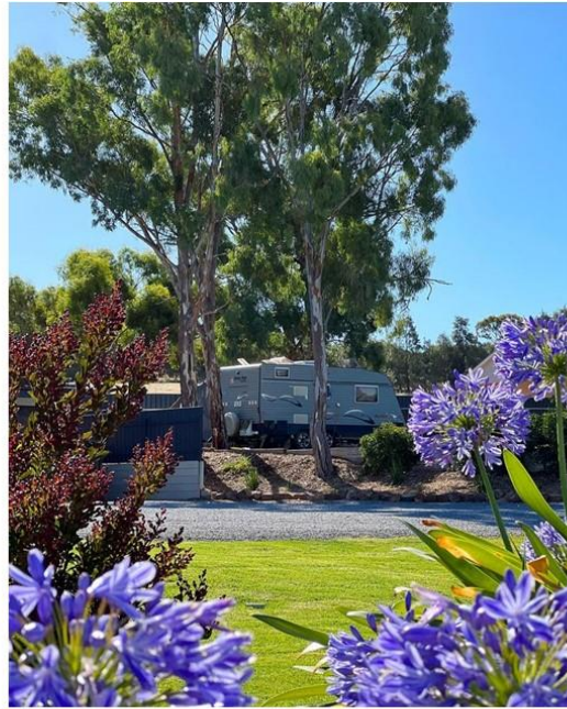
Clare Valley Caravan & Cabin Park