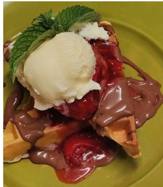
UPPside Restaurant & Cellar Door