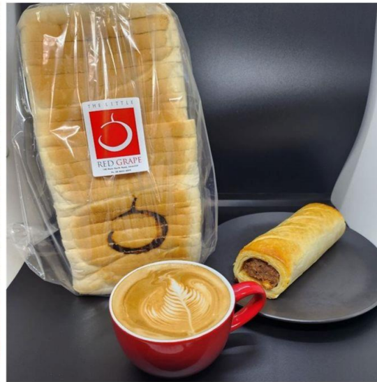
The Little Red Grape, Sevenhill