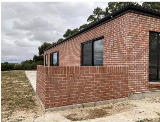
Mackenzie Home & Commercial