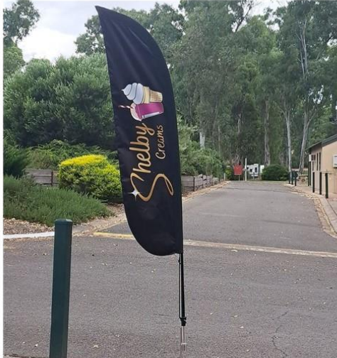
Discovery Park, Clare