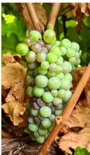
Tim Adams Wines