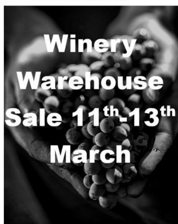
Sevenhill Cellars Winery Warehouse Sale