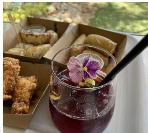
Right: Jeanneret Wines