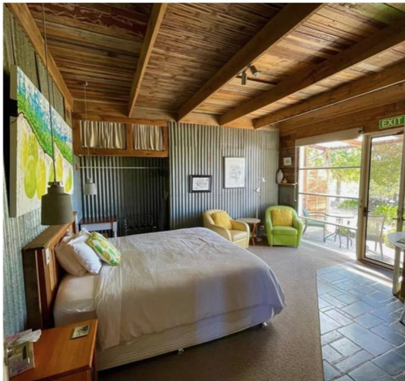
Below: Bed in a Shed at Leasingham

Thank you for your continued support of the Riesling Trail, it is very much appreciated.