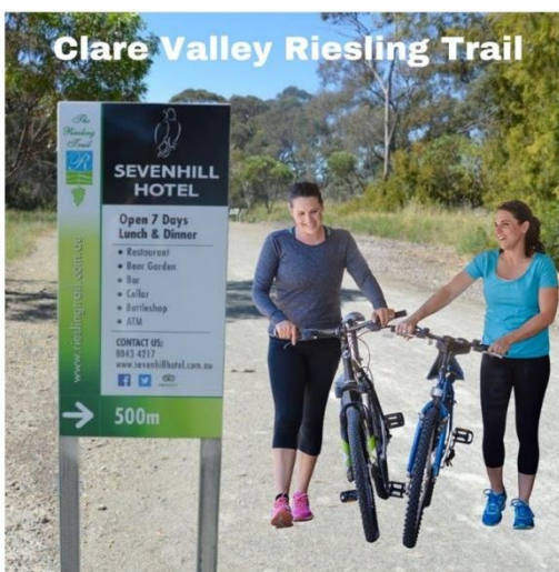
Clare Valley Riesling Trail