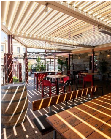
Bentleys Hotel, Clare