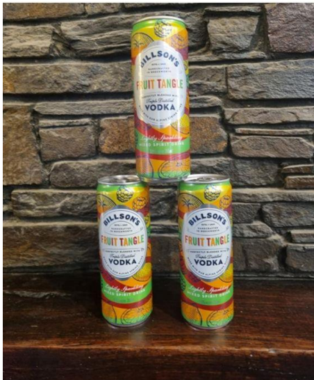
The Clare Hotel