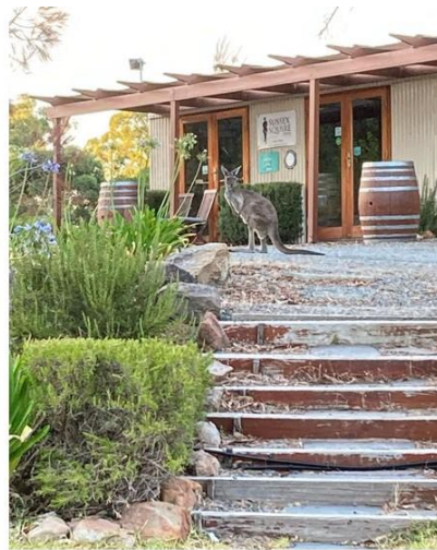
Sussex Squire Wines