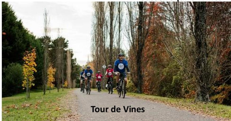
Tour de Vines