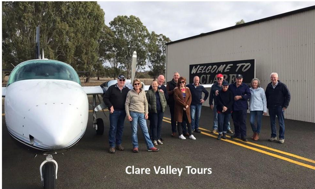
Clare Valley Tours