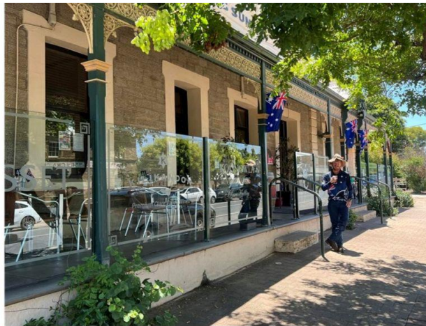
The Rising Sun Hotel, Auburn