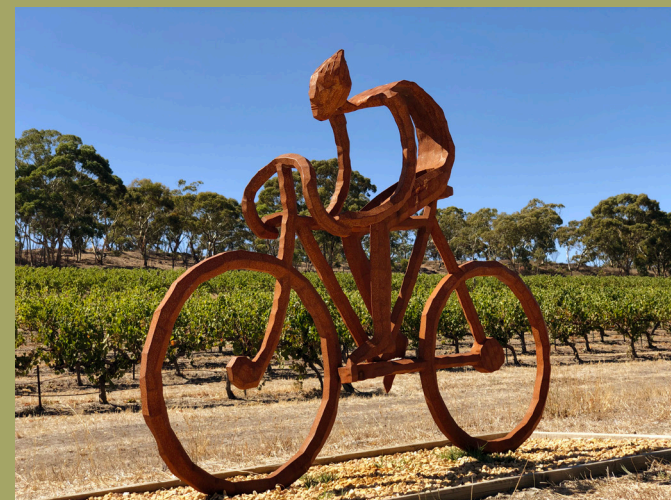
"The cyclist" - located between Quarry Road bridge and College Road, Sevenhill.